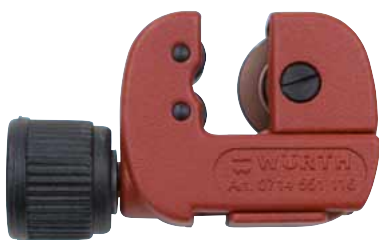
Mini pipe cutter