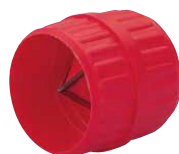
Interior and exterior deburrer