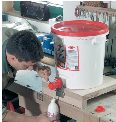
Screw on the hinged plate and the glue can be dispensed into the glue bottle or reservoir container of the glue roller after opening the lever.