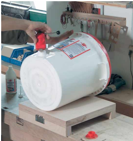
Lay glue bucket on its side. Pull out the spout and open the closure. Pull off the safety membranes. Screw on the glue tap and set up the glue container.