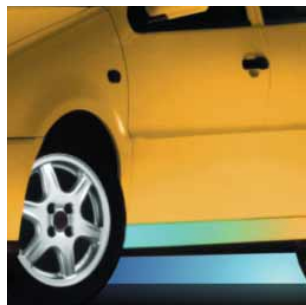
Protects permanently against paintwork damage.