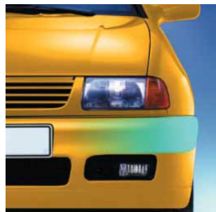
Protects against parking damage on bumpers.