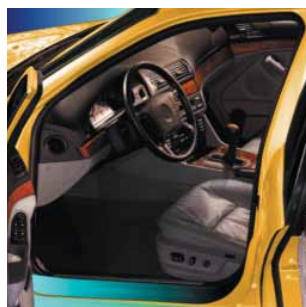
Protects against scratched paintwork in door jambs.