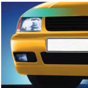
Protects against stone chipping on bumpers.