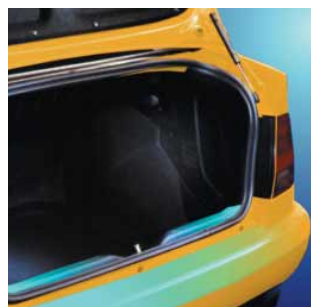
Protects loading edge against damages.