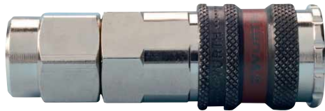
Series 2000 Quick-Action Coupling with Comfort Connection for Würth PU Hoses