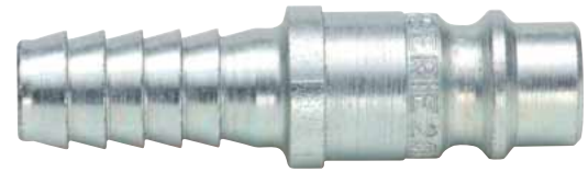
Series 2000 Plug-In Nipple with Hose Connection for Würth PVC and Painting Hoses