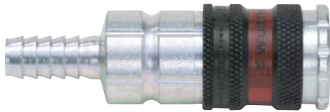
Series 2000 Quick-Action Coupling with Hose Connection for Würth PVC and Painting Hoses