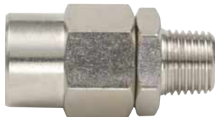
Series 2000 Push-In Tip with Comfort Connection for Würth PU Hoses, Male Thread