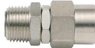
Series 2000 Push-In Tip, Rotating, with Comfort Connection for Würth PU Hoses, Male Thread