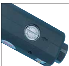
Integrated controller for speed adjustment