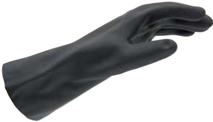
Heavy natural rubber and neoprene chemical protection glove