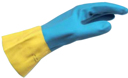
Natural rubber glove with outer neoprene layer