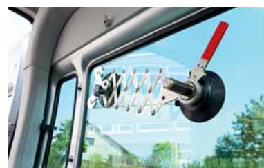
Using on a glued van side window