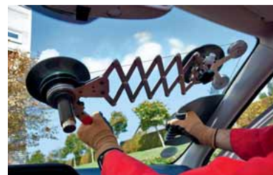
Windshields with very close gap dimensions