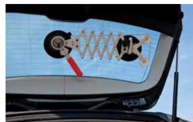
Cutting out a rear window