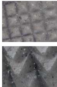
Illustration of three-dimensional pyramid structure

Abrasives: Aluminum oxide Color: Gray Bonding: All-synthetic resin Backing: Semi-flexible X-base Scattering: Micro-replication Connection: Red film Granularity: P120 - P600