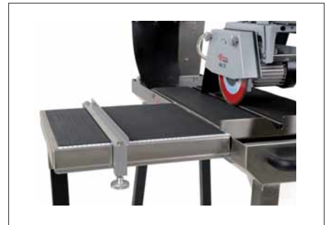
Fig. 4: An optional side table with a stop offers a reliable support option for large-area materials.