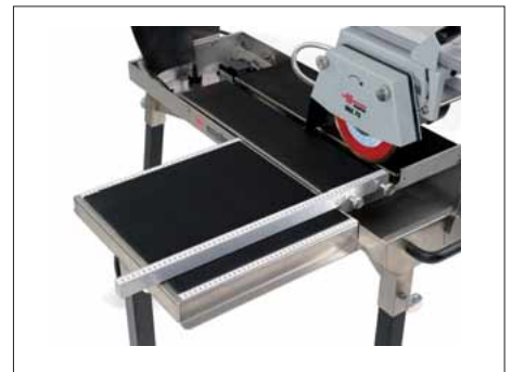
Fig. 5: To carry out precision work quickly and reliably, it is advisable to use the optionally available side stop with a millimeter scale.