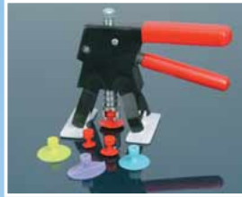
Use with PinPuller®