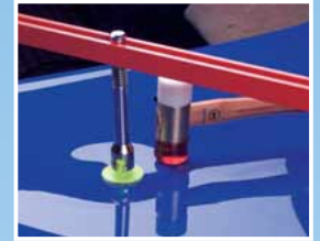
Use with Maxilifter

PinPuller® adapter for PinPuller®, Minilifter, Dent Lifter, Maxilifter