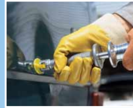
Use with Dent Lifter