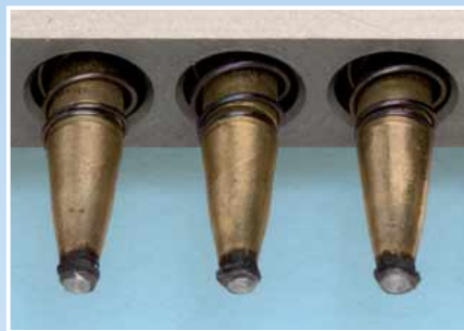
Ideal electrodes with projection that can easily be filed down again.