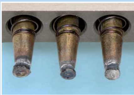
Eroded electrodes due to excessively long welding time.