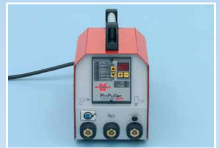
Optimum work results thanks to PinPuller®-Spot Art. No. 0691 500 290.