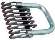
Art. No. 0691 500144 Bi-Puller for corrugated wire