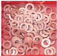
Art. No. 0691 500 280 Washers, 8x16x1.5 mm