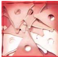
Art. No. 0691 500 281 Special Triangular Lug