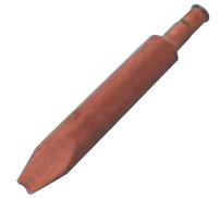
Art. No. 0691 500148 Electrode for corrugated wire