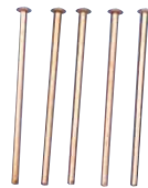
Art. No. 0691 500 081 Welding Bolt, dia. 2.6 mm