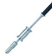
Art. No. 0691 500 076 Pulling Device for welding bolt