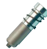
Art. No. 0691 500 263 Spare Chuck for pulling device