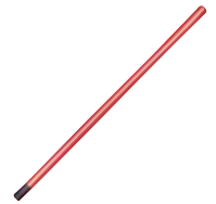
Art. No. 0691 500 282 Carbon Electrode for pulling in