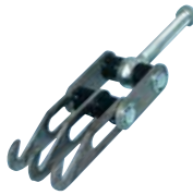
Art. No. 0691 500143 3-Finger Claw for Maxilifter