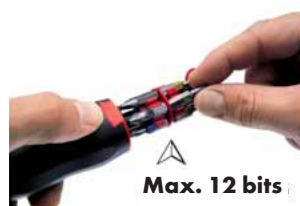
Easy removal of the desired bit.