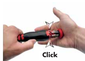
Secure closing thanks to "snap lock".