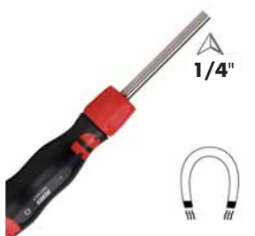
Magnetic blade mount for 1/4" bits.