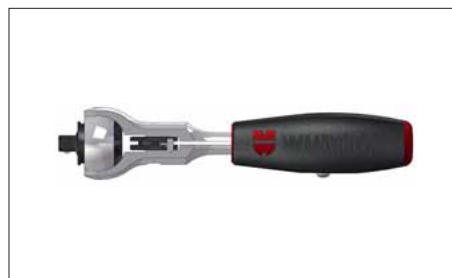
Can be used like a screwdriver