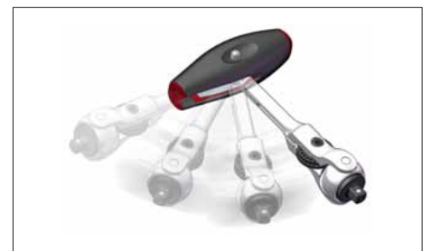
Can be used with T-handle and swiveling ratchet head. Any desired angle can be set. Locked in place with rotary wheel.