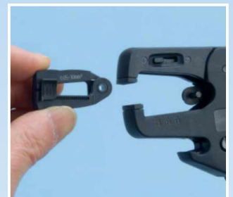
Easy-change stripping cassette.