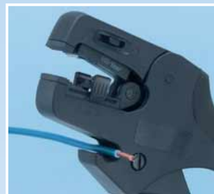
Cutting up to 10 mm 2 .