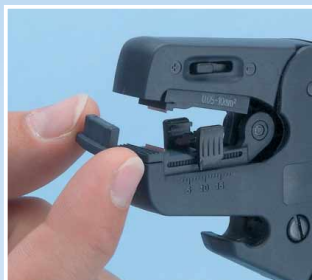
Swappable retaining jaws.