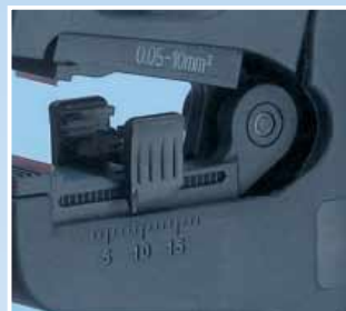
Adjustable length stop.