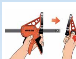
Conversion to spreading