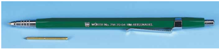
Art. No. 0714 70 04 Length 150 mm Pack Qty. 1