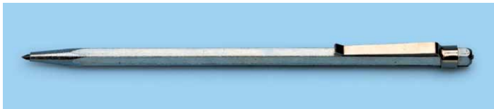
Hart metal replacem. pin Art. No. 0714 70 05 Pack Qty. 1