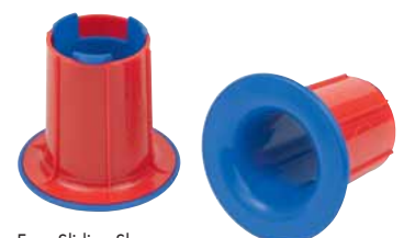
Ergo Sliding Sleeves