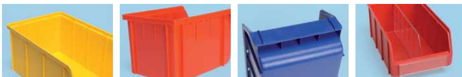
Circumferential stacking edge