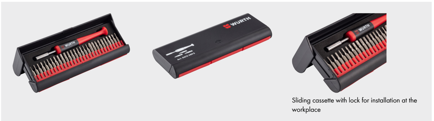
Sliding cassette with lock for installation at the workplace

Including electricians, model makers and hardware technicians